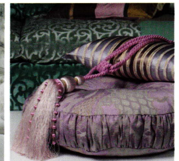
Perfect for Fine Silks

FOR MORE INFORMATION, VISIT www.microsealuk.com or CALL 0203 005 3229