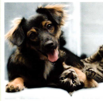
Safe for all your Family